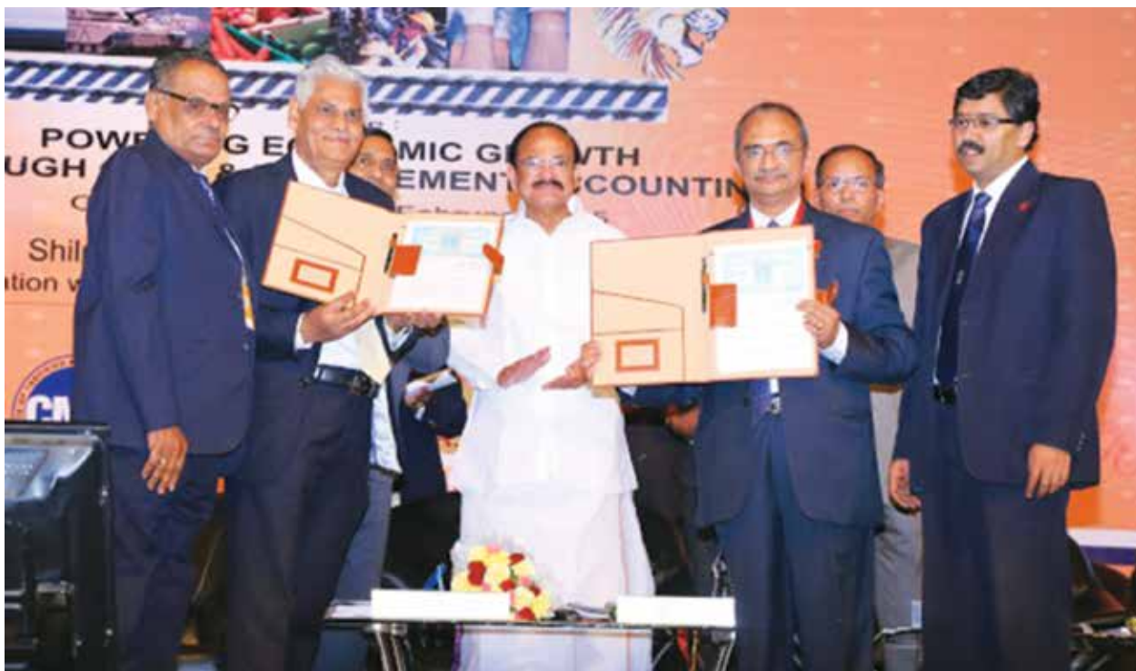
MoU inked with ICAI in the presence of Hon'ble Union Minister (Urban Development) Mr Venkaiah Naidu

Appreciating the strengths of collaborative research in the field of management, the Institute of Public Enterprise, Hyderabad, India and the EGADE Business School, the graduate business school of Tecnológico de Monterrey, Mexico, propose to institute a joint centre for research in Corporate research, that would promote opportunities for joint faculty research from both the institutions in various domains of corporate research.