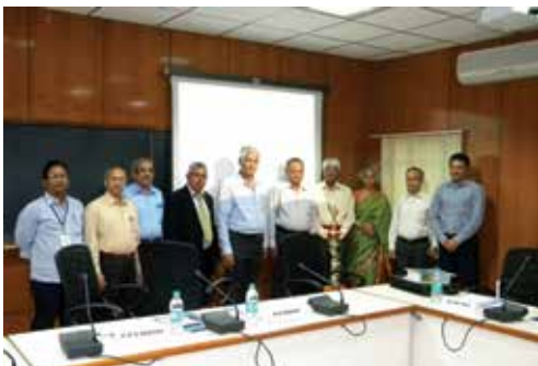
At the inaugural session of Board Development program held in November, 2014

The Board development programmes for shipping corporation of India was conducted during 8-10 October, 2014. Program was held from 11 th to 13 th November, 2014.