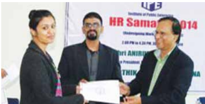
Prize Distribution at HR Samathi