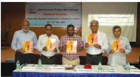
Release of Souvenir at the Seminar on Training Need Assessment