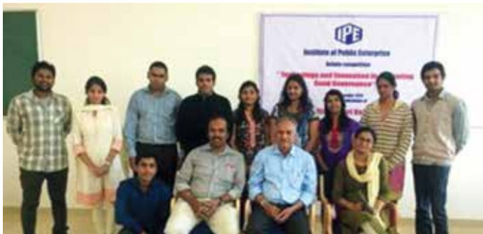
Participants in the Debate Competition