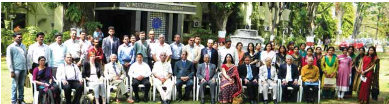
Delegates at the 2nd International Conferences on 'Transformative Social Science Research'