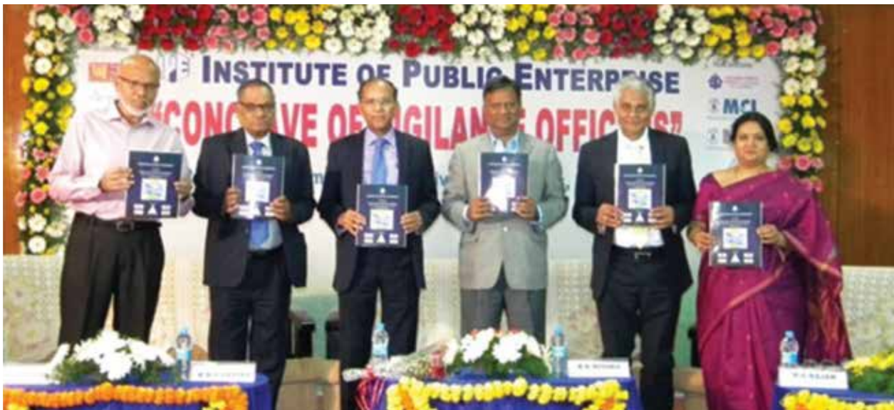
Release of souvenir at the Conclave of Vigilance Officers

The project was commissioned in IPE to study the impact of S&T input on Gross District Domestic Products (GDDP). The districts of Adilabad, Visakapatnam, Srikakulam, Guntur and East Godavari has been investigated. The study entails development of S&T index for agriculture, industrial & services sector and time series analysis from 2000-01 to 2012-13.