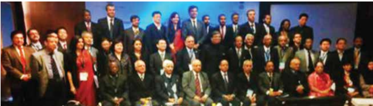
Delegates at the International Workshop on 'Performance Evaluation and Management of State Owned Enterprises'