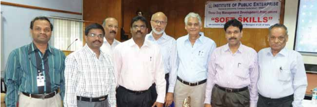
Inaugural session of MDP on soft skills to officers of LIC