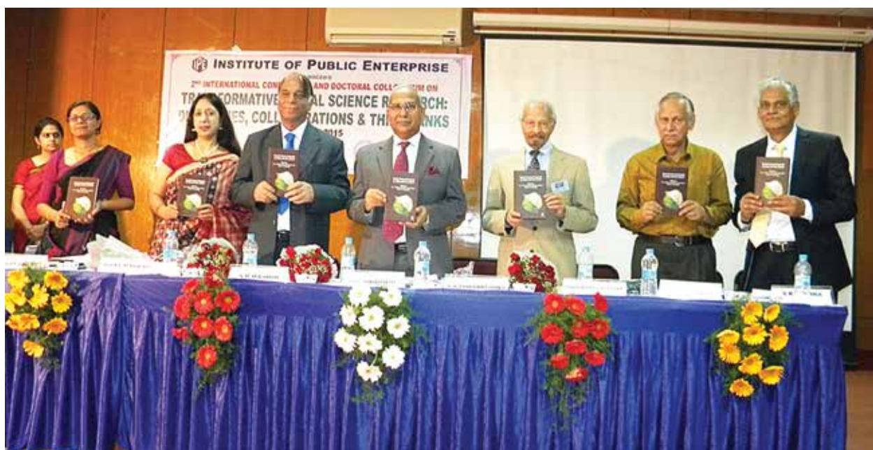
Release of the book 'Social Science Research in India & the World' Published by Routledge